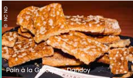
Pain à la Grecque - Dandoy