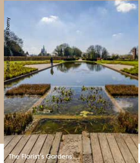
the Basilica of the Sacred Heart