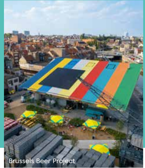
Brussels Beer Project