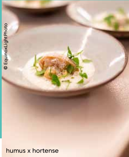
humus x hortense