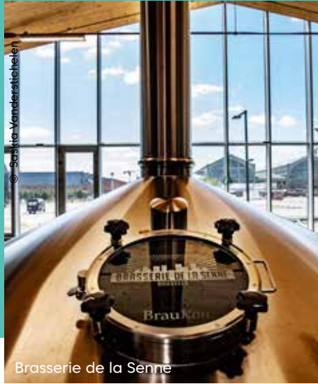
Brasserie de la Senne